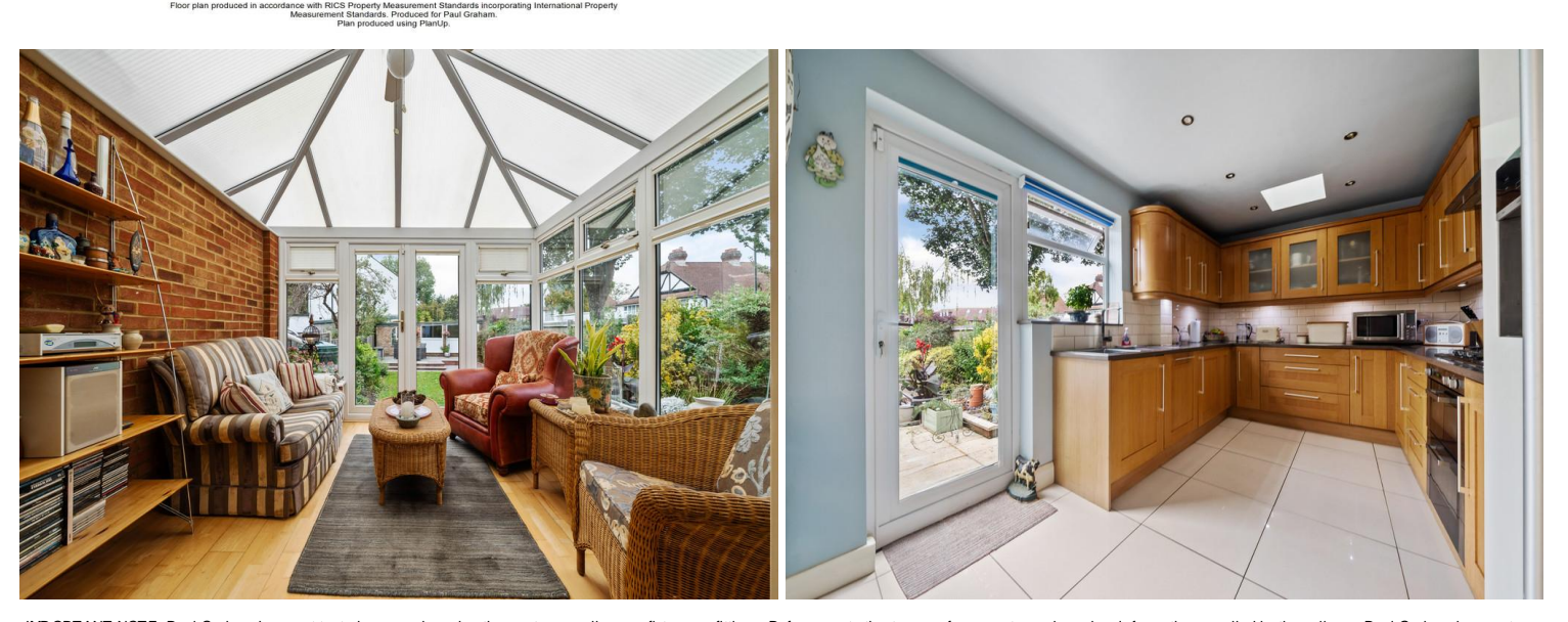
IMP ORTANT NOTE: Paul Graham have not tested any services, heating system, appliances, fixtures or fittings. References to the tenu re of a property a re based on information supplied by the seller as Paul Graham have not had sight of the title documents. Neither has Paul Graham checked any existing or necessary planning consents, building regul ations or rights of way. Prospective purchasers are advised to obtain verification from their solicitor or surveyor. PLEASE NOTE: All measurements are approximate and represent the maximum dimensions of any room (into bays and alcoves) and a margin of error should be allowed.