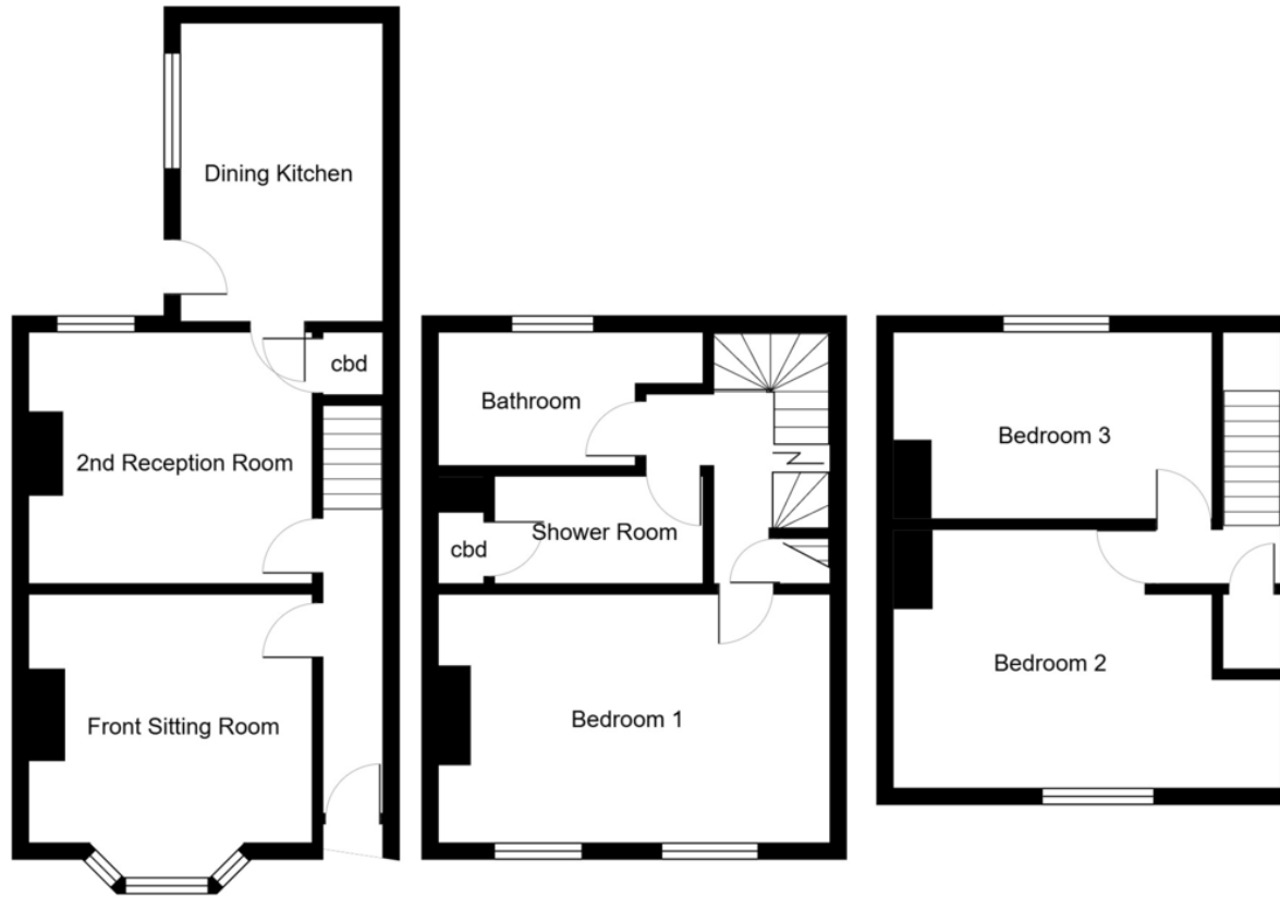
DRAFT FLOOR PLAN - AWAITING VENDOR'S APPROVAL

All measurements are approximate and for display purposes only