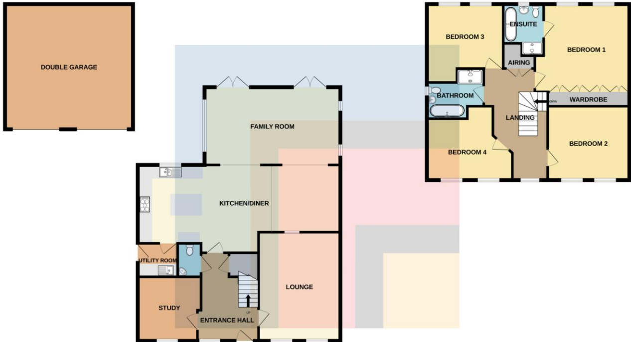
TOTAL FLOOR AREA: 2253 sq.ft. (209.3 sq.m.) approx.

Whilst every attempt has been made to ensure the accuracy of the floorplan contained here, measurements of doors, windows, rooms and any other items are approximate and no responsibility is taken for any error, omission or mis-statement. This plan is for illustrative purposes only and should be used as such by any prospective purchaser. The services, systems and appliances shown have not been tested and no guarantee as to their operability or efficiency can be given. Made with Metropix 6/2024