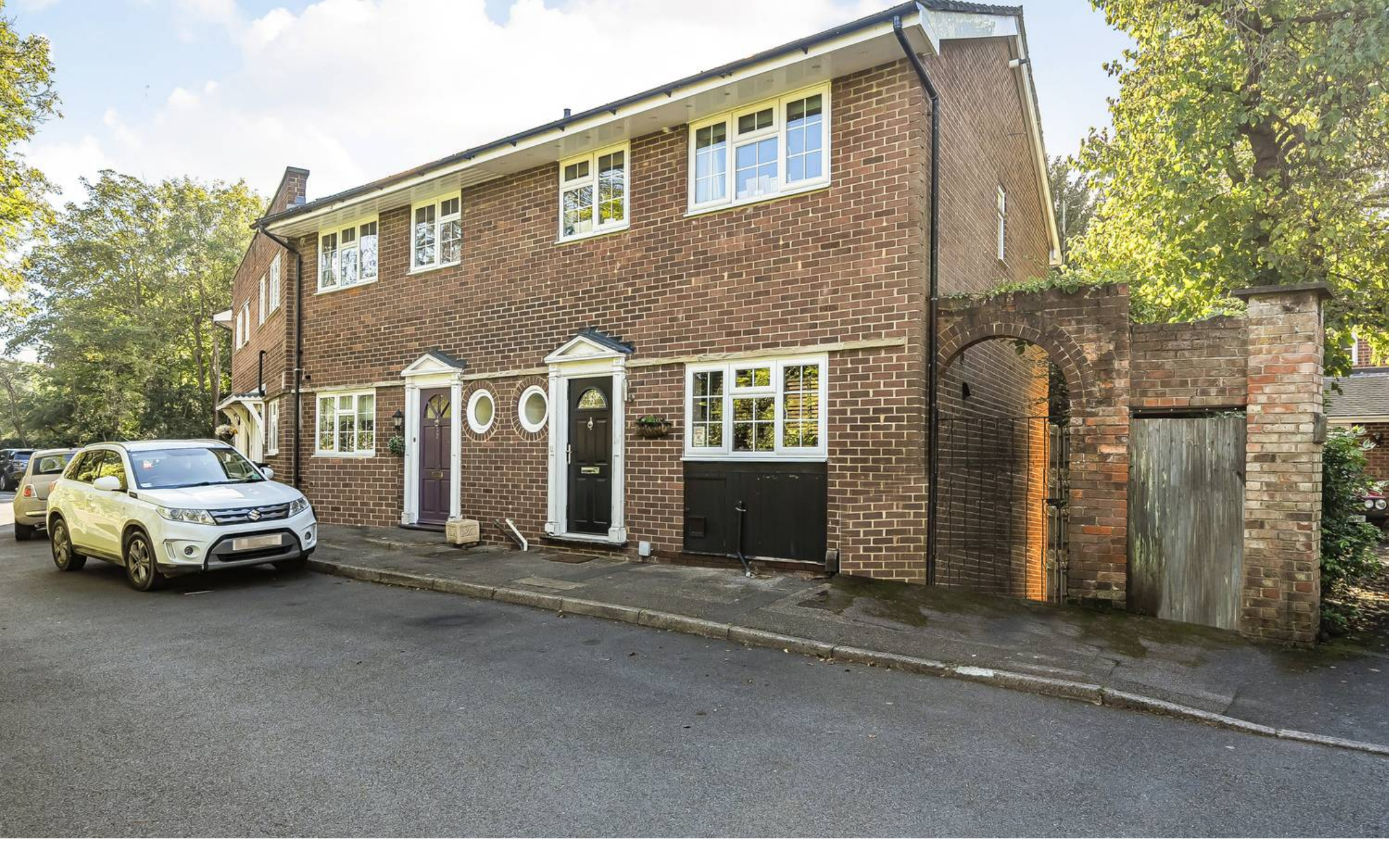
Hylands Mews, Epsom