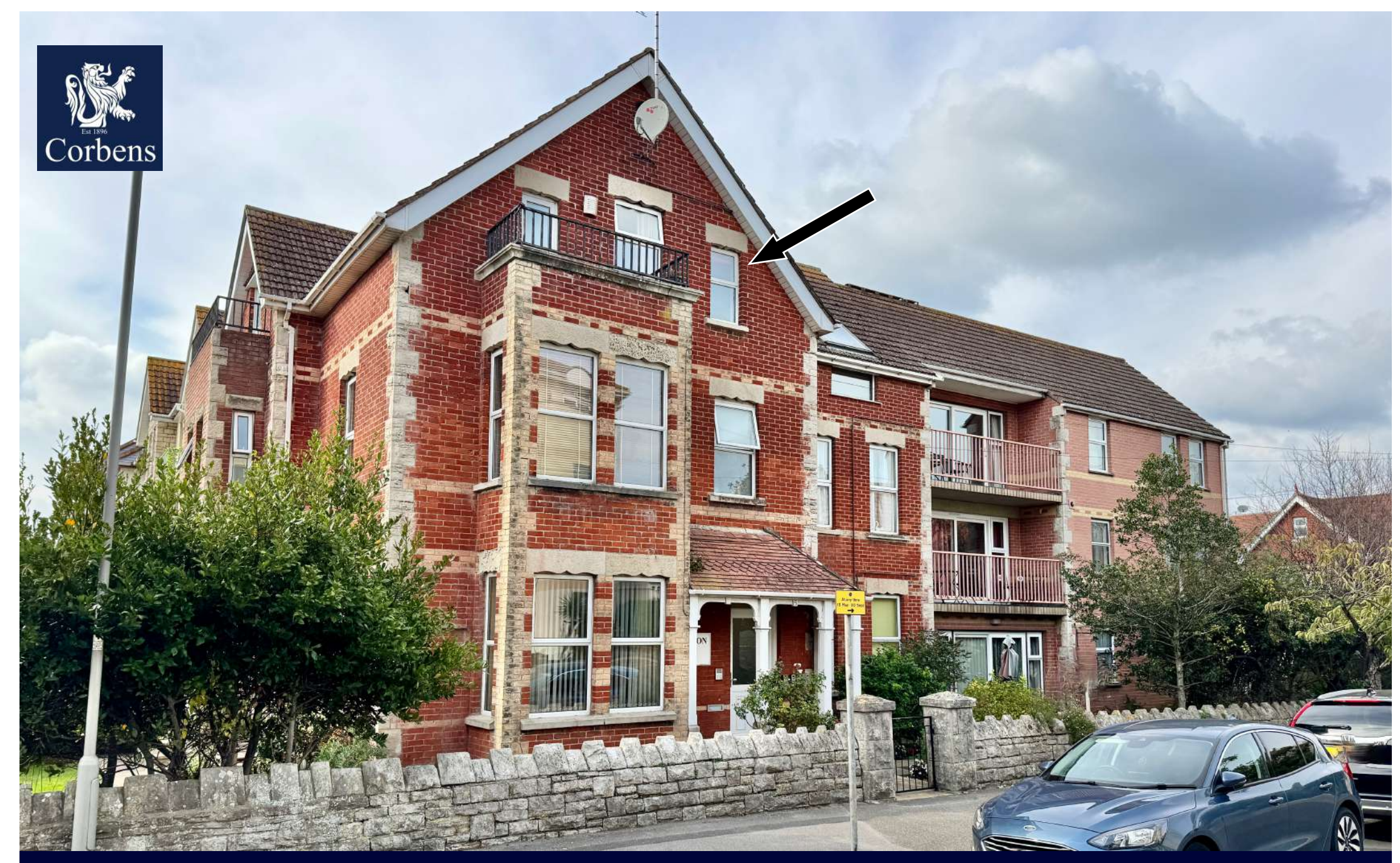
FLAT 5 AVALON, REMPSTONE ROAD, SWANAGE £225,000 Leasehold