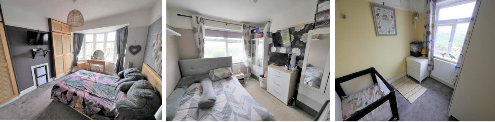
Ashcroft Road, Ipswich, IP1 6AD