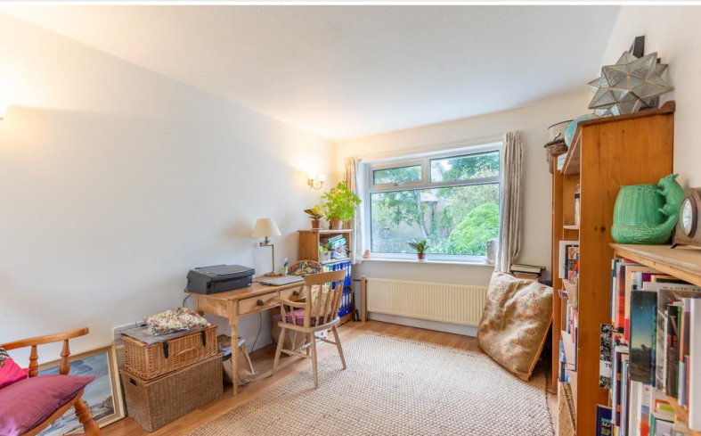
Dining Room/Bedroom Three/Study