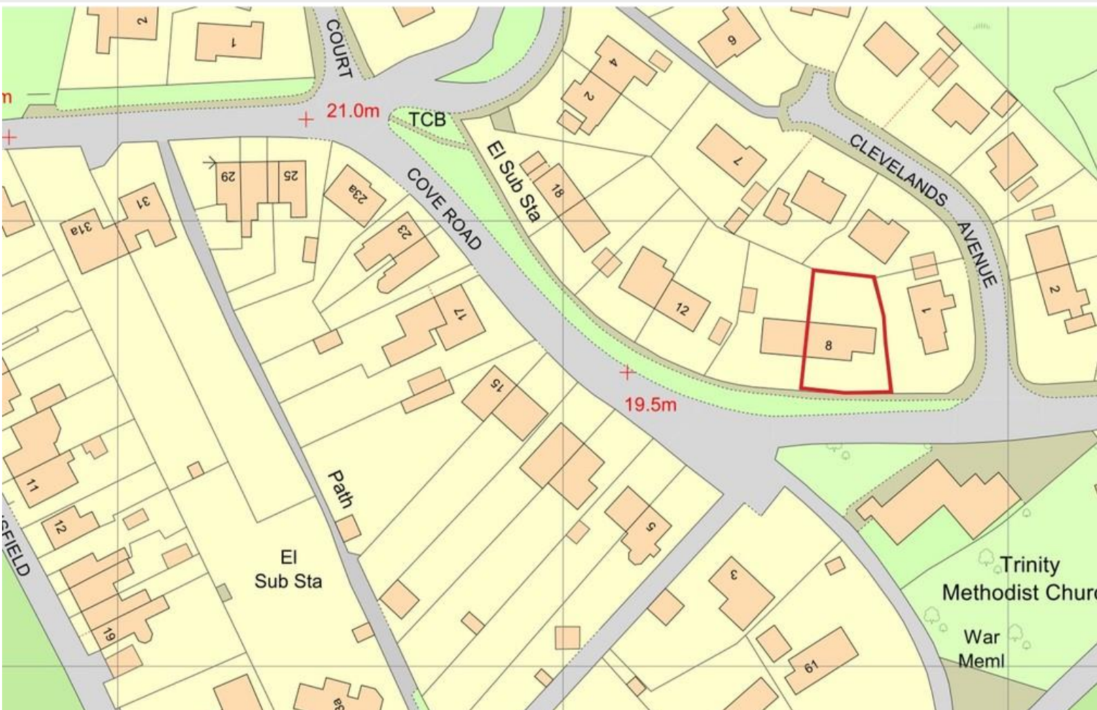
Ordnance Survey 01017664

Request a Viewing Online or Call 01524 761806