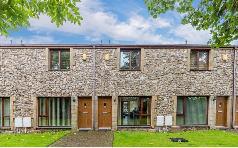
11 Lapwing House