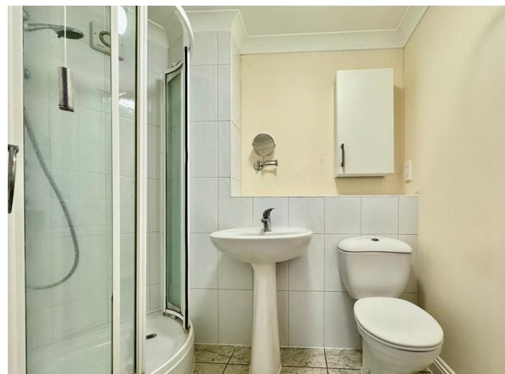
To view this property call Curtis O' Boyle Estate Agents on 01621\ 855558