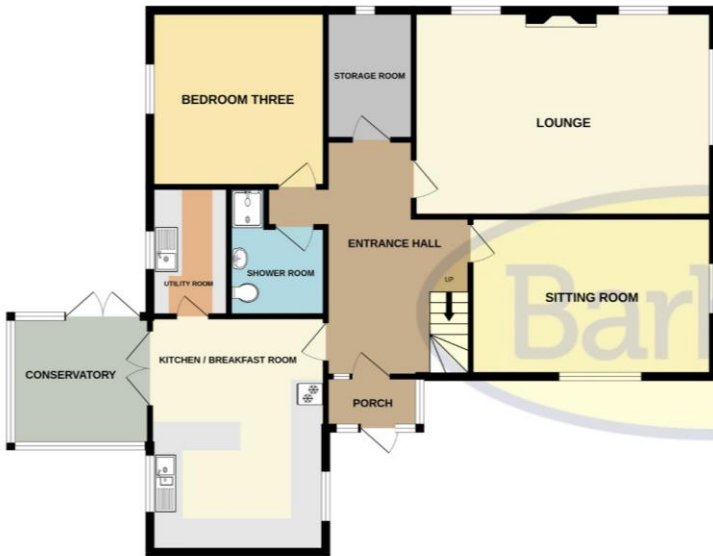
GROUND FLOOR 1151 sq.ft. (107.0 sq.m.) approx.