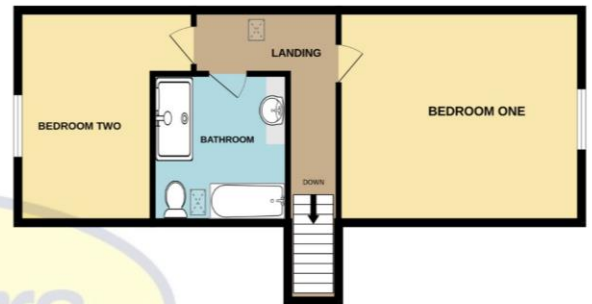
1ST FLOOR 550 sq.ft. (51.1 sq.m.) approx.