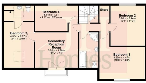
Total area: approx. 183.0 sq. metres (1970.0 sq. feet)