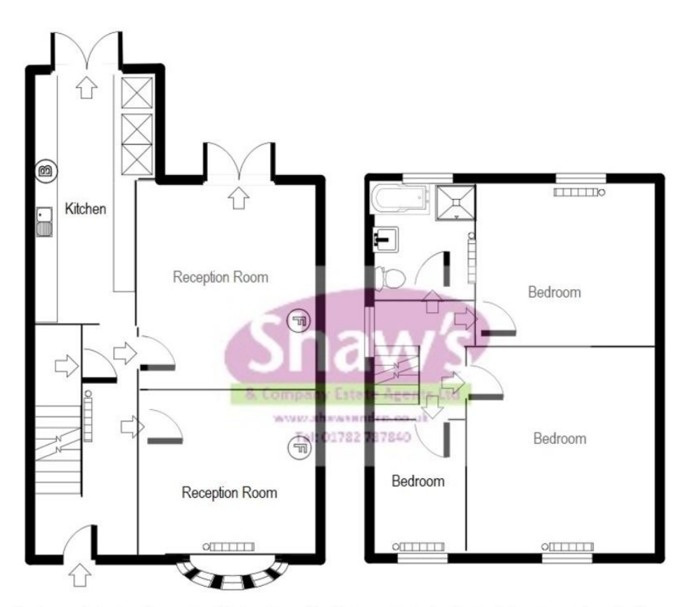
Whilst every attempt has been made to ensure the accuracy of the floor plan contained here, measurements of doors, windows, rooms and any other items are approximate and no responsibility is taken for any error, omission, or mis-statement and the floor plan is an illustration only as a guide. This plan is for illustrative purposes only and should be used as such by any prospective purchaser or tenant. The services, systems, appliances, shown have not been tested and no guarantee as to their operation or efficiency can be given. Made with Visual Builder