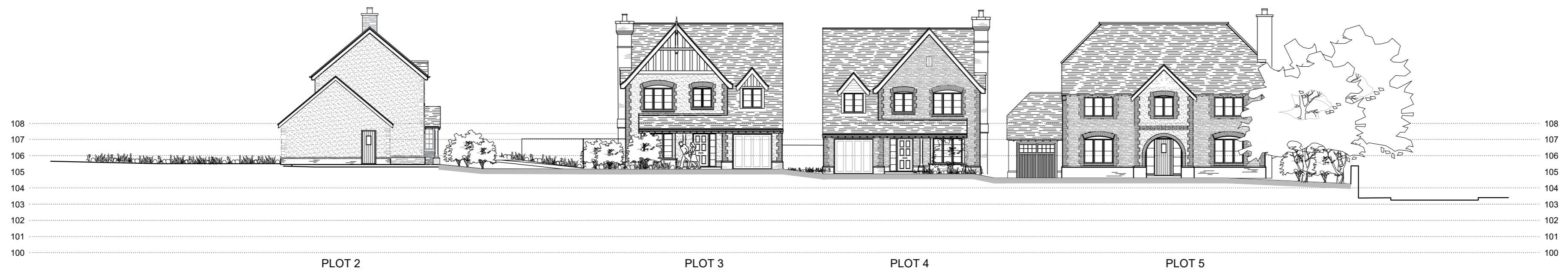
SECTION B-B - SITE SECTION

Note: Please Refer to The Proposed Site Plan for Sections Location