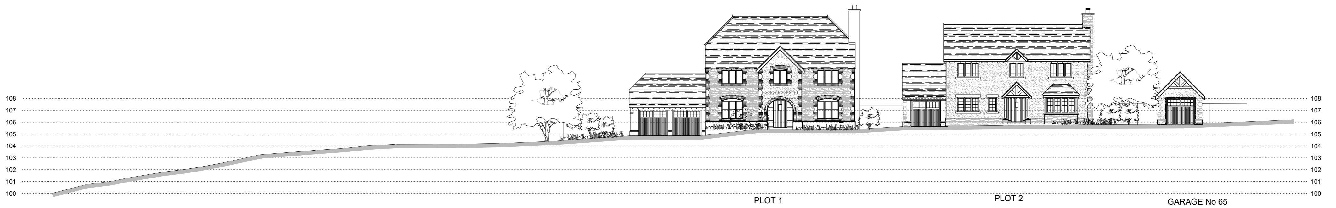
SECTION A-A - SITE SECTION