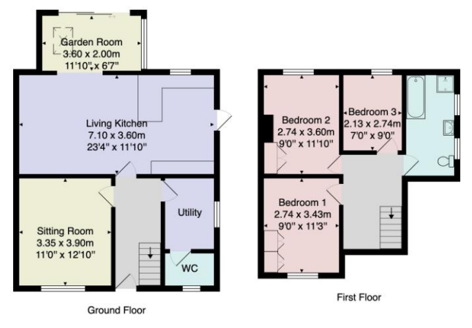
Total Area: 103.3 m² ... 1112 ft² All measurements are approximate and for display purposes only. No liability is accepted by either the agency or Box Property Solutions Ltd as to the exact measurements of the rooms. Box Property Solutions Ltd retains the copyright on this plan and allows agents to use it with agreed permission.