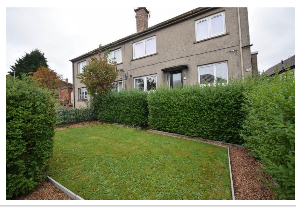
Next Home - 15 Campsie Road, Perth, PH1 2EH