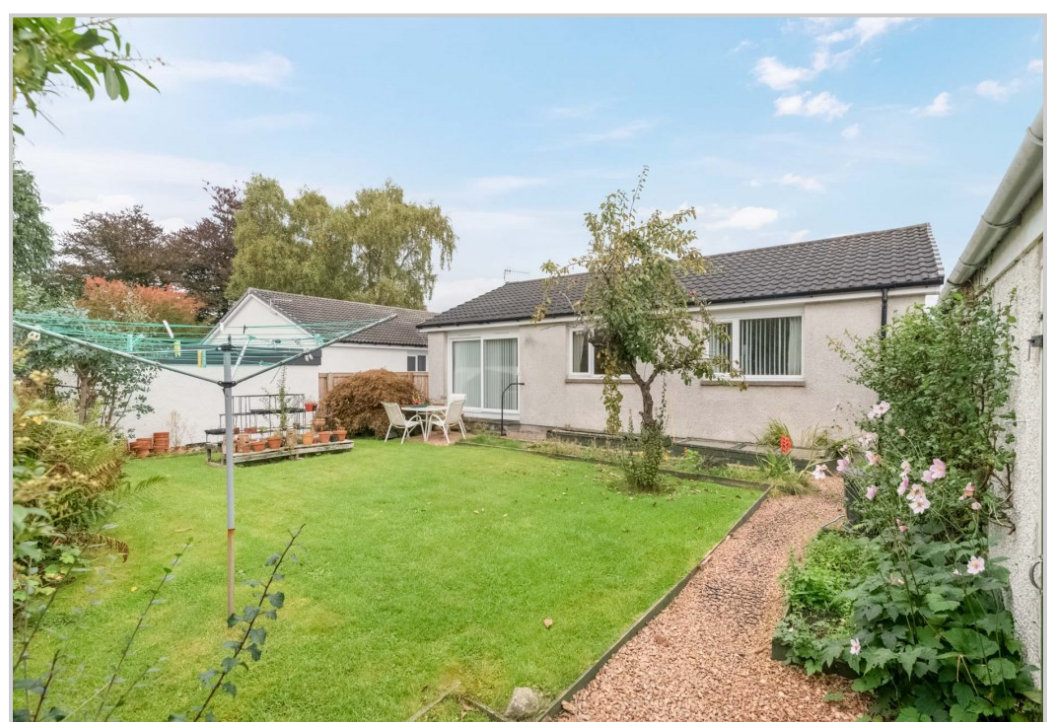
These particulars are believed to be correct, but their accuracy is not guaranteed and they do not form part of any contract. All measurements are approximate only.