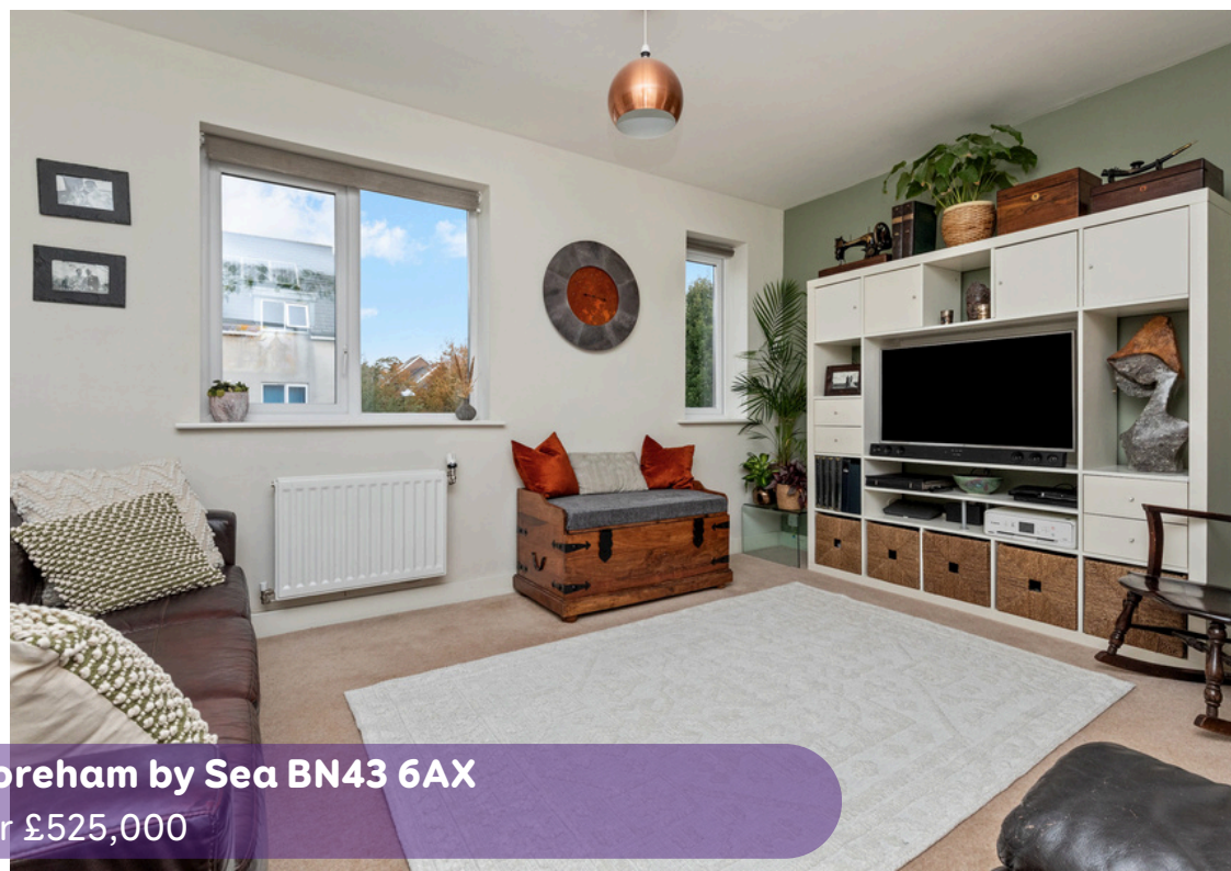
35 Rainbow Square, Shoreham by Sea BN43 6AX Offers Over £525,000