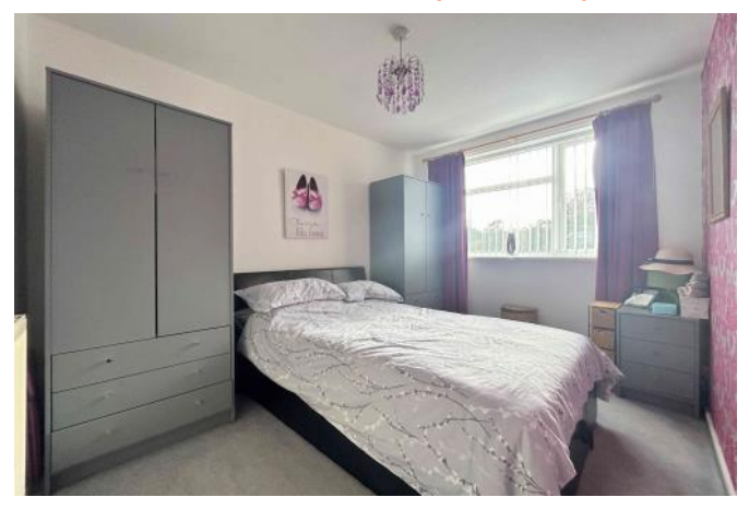
A double room with a radiator and a UPVC window.