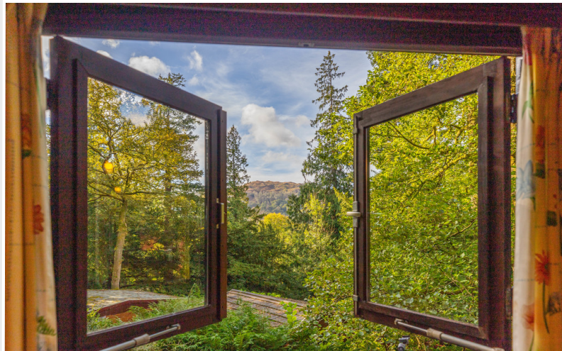
View from Bedroom 1