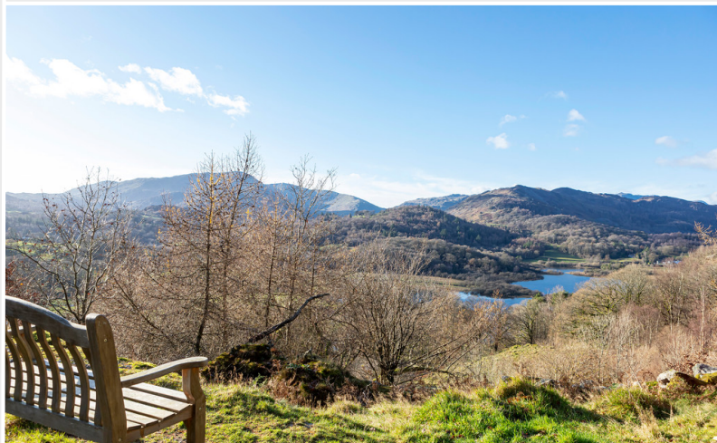
Communal Grounds and View