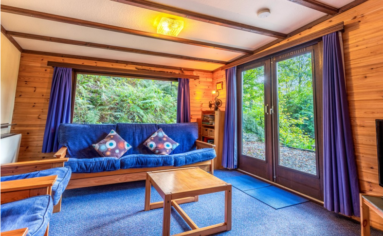
Dual Aspect Lounge