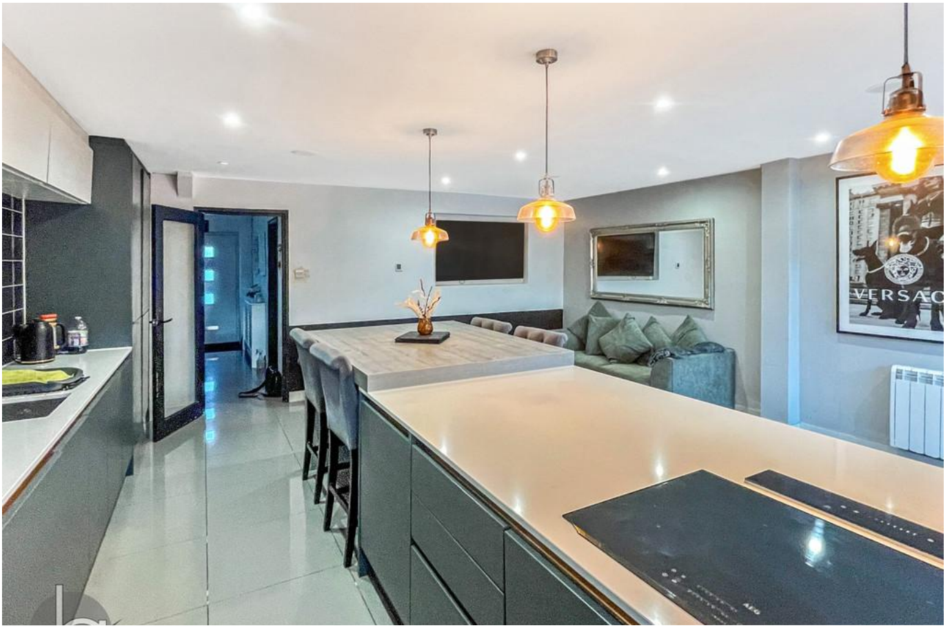
Heywood Way, Heybridge CM9 4BH