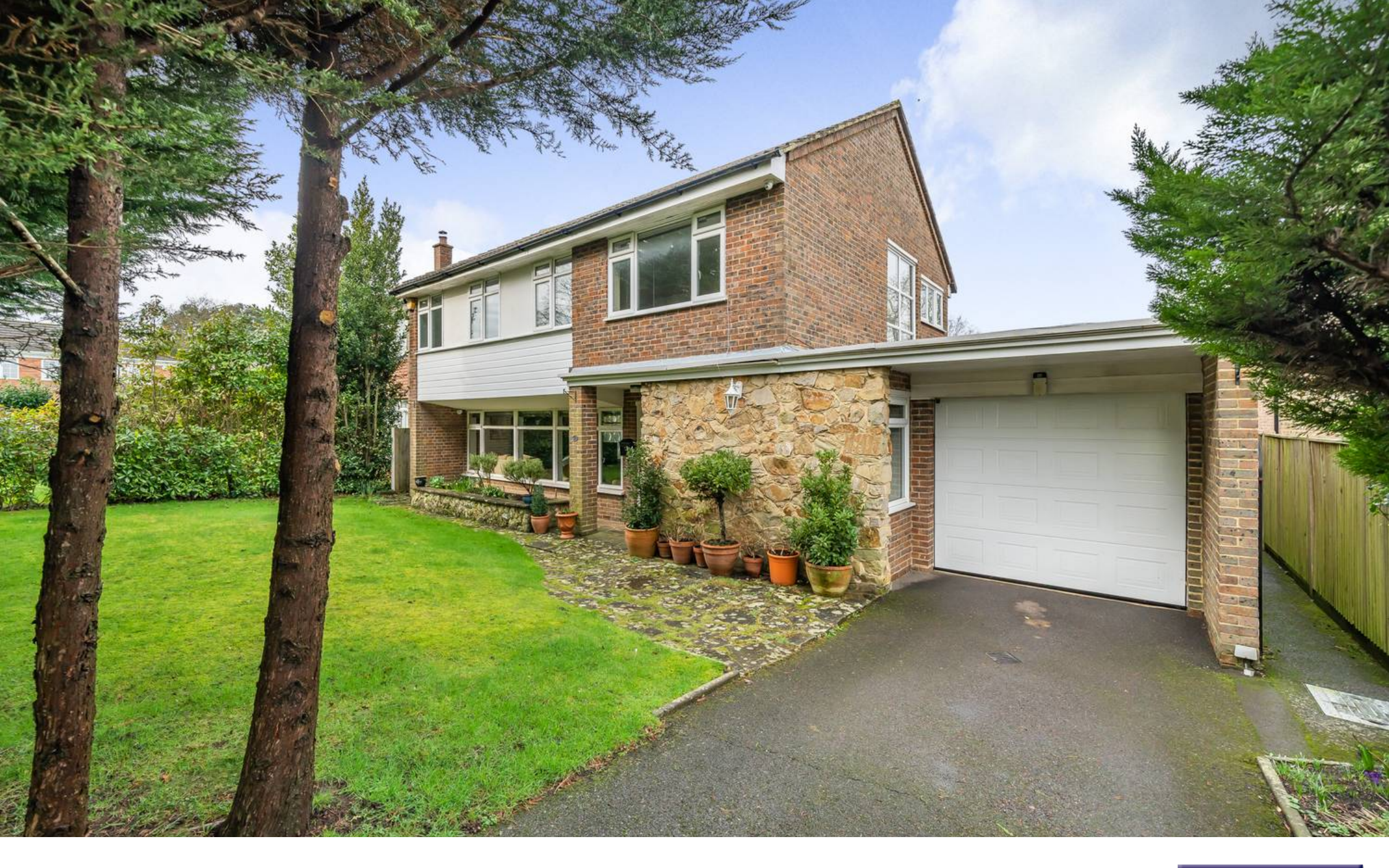
3 Waterfield Drive, Warlingham - CR6 9HP Guide Price £875,000