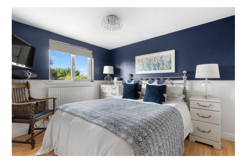
Bedroom One 3.88m (12'9") max x 2.62m (8'7")