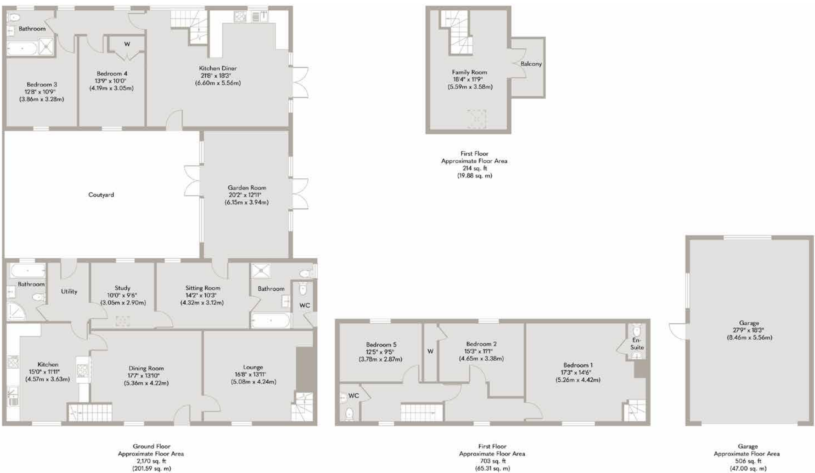
Whilst every attempt has been made to ensure the accuracy of the floor plan contained here, measurements of doors, windows, rooms and any other items are approximate and no responsibility is taken for any error, omission, or mis-statement. This plan is for illustrative purposes only and should be used as such by any prospective purchaser or tenant. The services, systems and appliances shown have not been tested and no guarantee as to their operability or efficiency can be given. Copyright V360 Ltd 2023 | www.houseviz.com