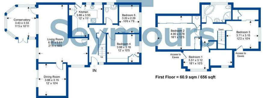
Ground Floor = 99.2 sqm / 1068 sqft