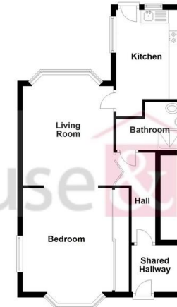
Total area: approx. 50.8 sq. metres (546.9 sq. feet)