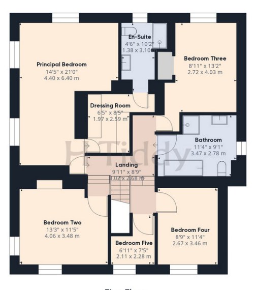
First Floor (952.18 sq.ft (88.46 sq.m.))