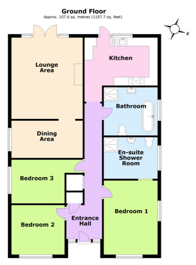
Total area: approx. 107.6 sq. metres (1157.7 sq. feet)