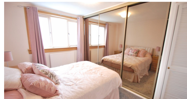
57 Harviestoun Grove