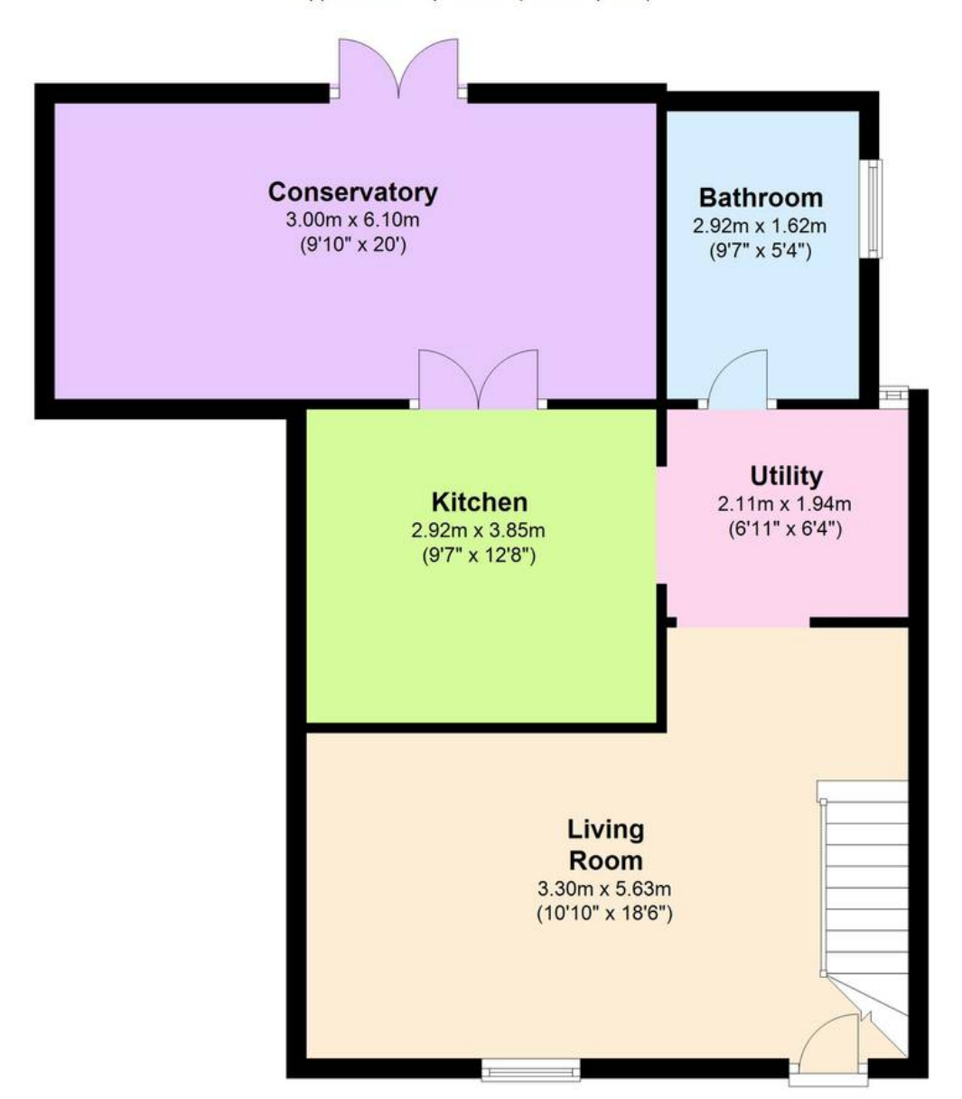
First Floor Approx. 35.1 sq. metres (377.3 sq. feet)

Approx. 60.8 sq. metres (654.2 sq. feet)