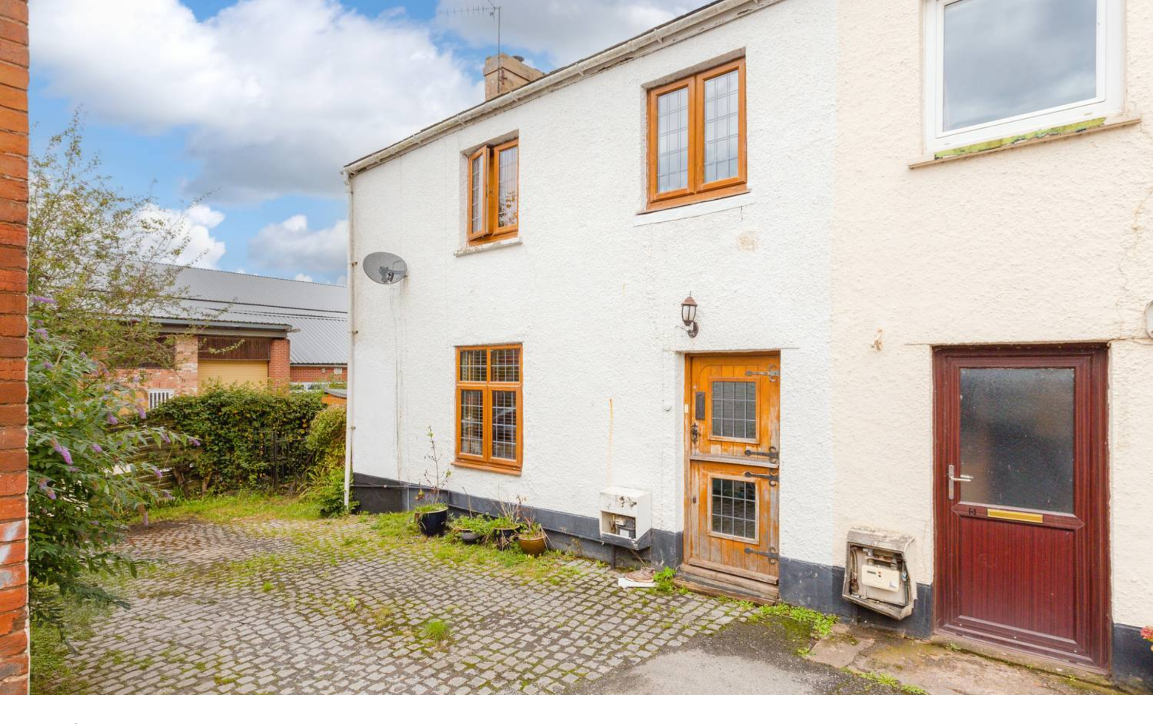
6 Mill Cottages, Stoke Canon, Exeter EX5 4EQ