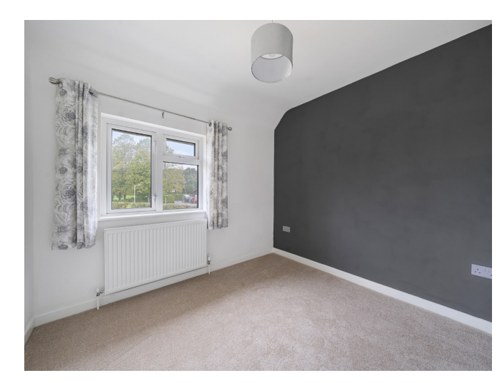
GENERAL REMARKS AND STIPULATIONS:

Tenure: The property is offered for sale freehold by private treaty with vacant possession on completion.