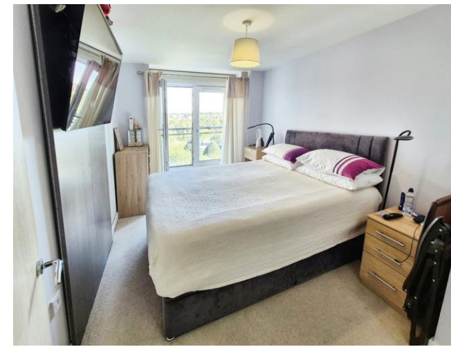
BEDROOM TWO 11' 3" x 8' 2" (3.45m x 2.5m) Front aspect window, carpet and electric radiator.

EN-SUITE SHOWER ROOM Enclosed shower cubicle, low-level WC, wash hand basin, electric towel radiator and laminate floor.