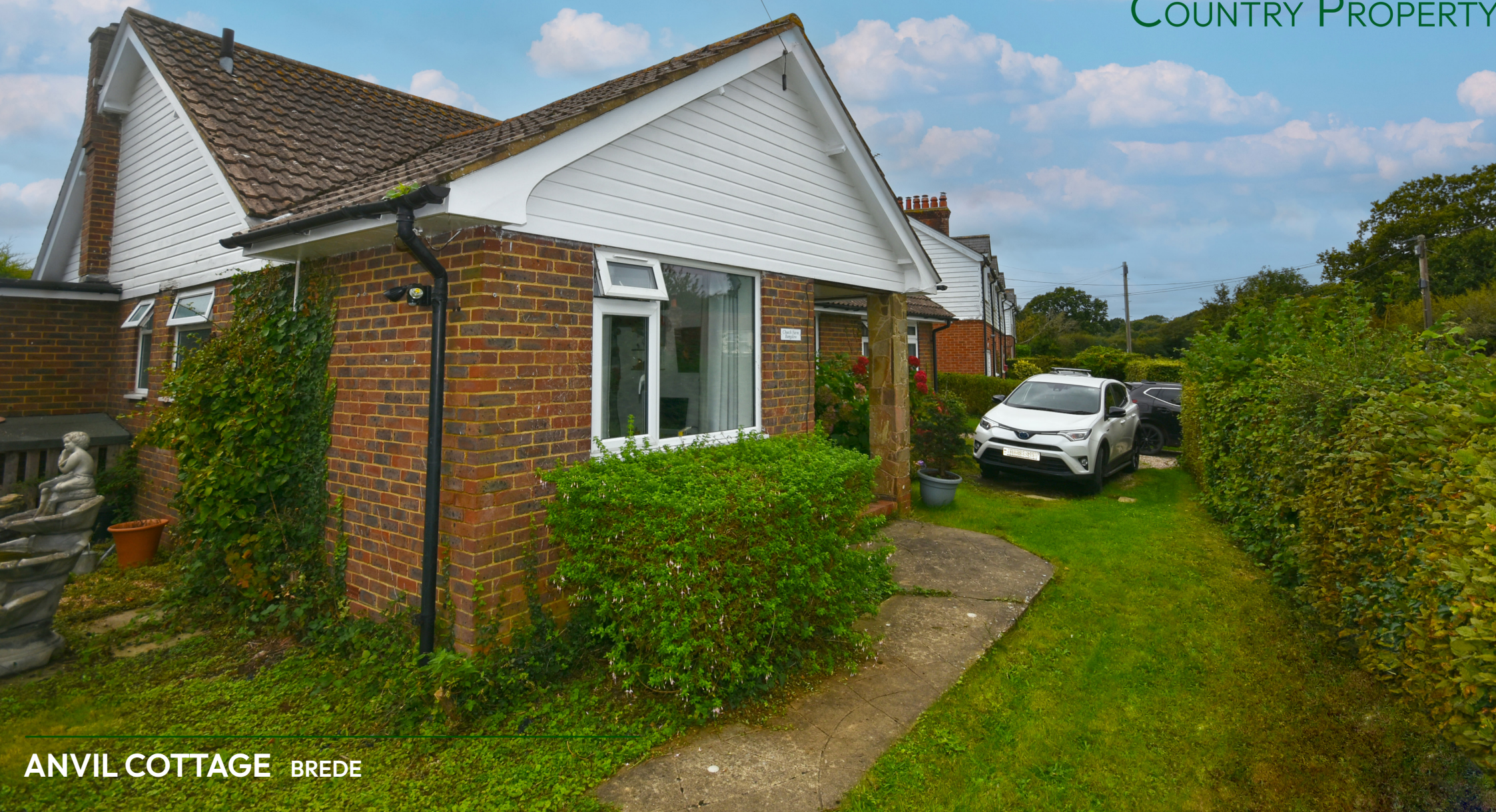
ANVIL COTTAGE BREDE