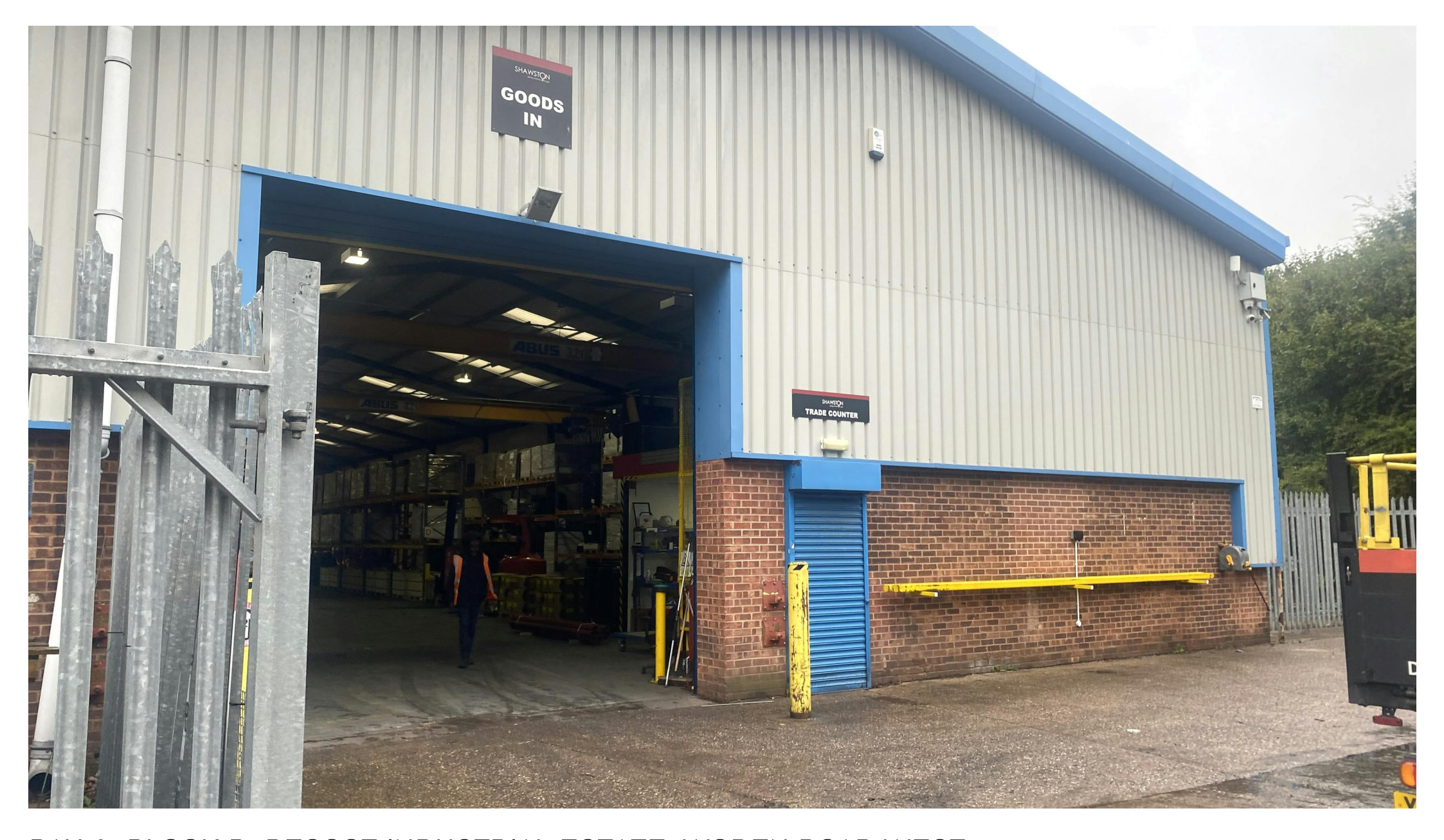
BAY 1, BLOCK D, BESCOT INDUSTRIAL ESTATE, WODEN ROAD WEST, WEDNESBURY, WS10 7SG