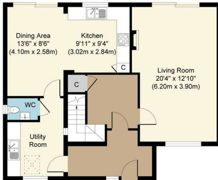
Ground Floor Approximate Floor Area 756 sq. ft (70.24 sq. m)