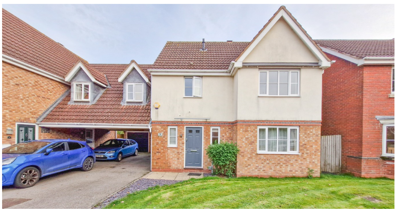
4 Bedrooms | 2 Bathrooms | 2 Reception Rooms | Garage