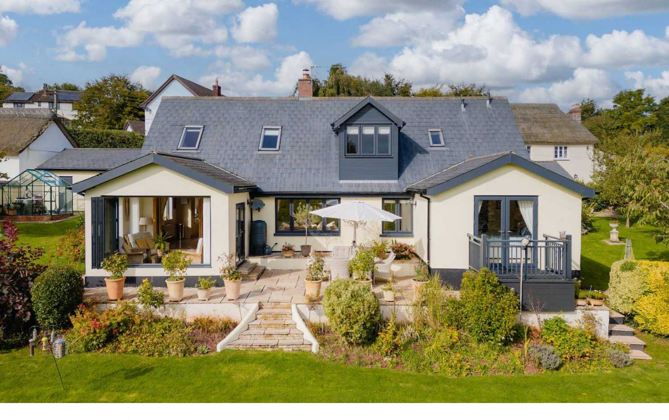
Burghley, Colebrooke, EX17 5JS