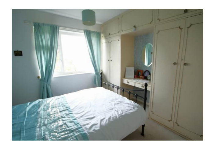
BEDROOM 2: 12' 2" x 8' 2" (3.71\,\mathrm{m}\,\mathrm{x}\,2.49\,\mathrm{m}) Radiator and double glazed window. Built in storage cupboard.

BEDROOM 1: 11' 2" x 10' 4" (3.4 \,\mathrm{m}\,\mathrm{x}\,3.15\,\mathrm{m}) Radiator and double glazed window. Fitted wardrobes and dressing table area.