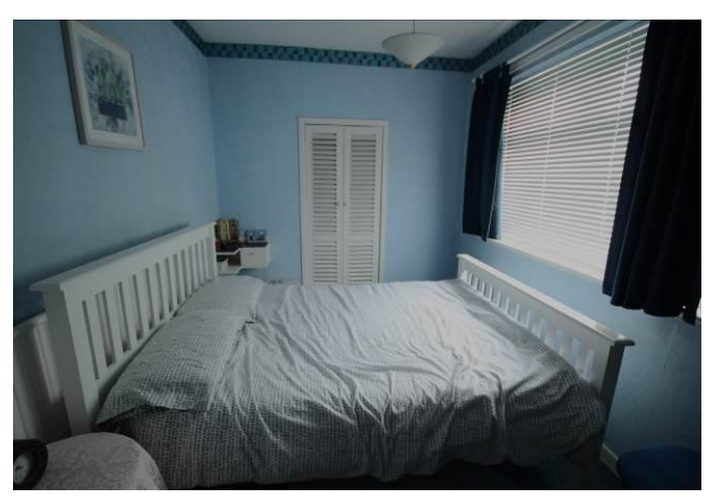
BEDROOM 3: 9' 6" x 9' 6"(max) (2.9m x 2.9m) Radiator and double glazed window. Built in storage cupboard.