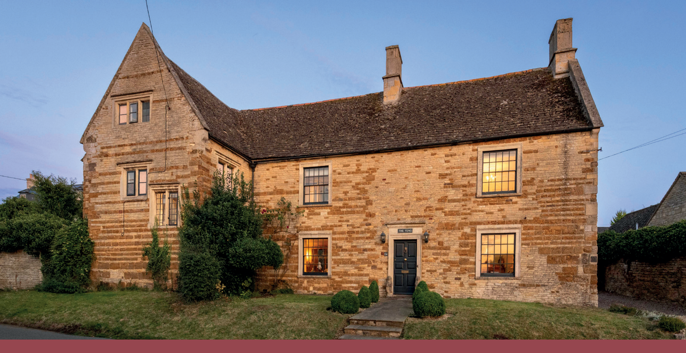
The Yews, High Street, Gretton, Northamptonshire NN17 3DE