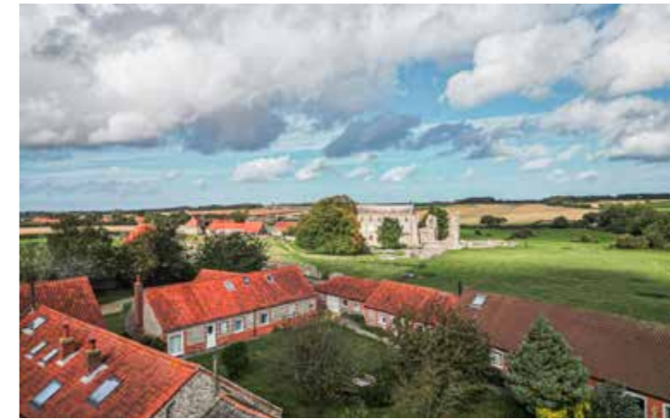
Aerial view looking towards Binham Priory

“The views are spectacular; it's a really special setting.”