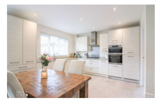
Florence Drive Amington, Tamworth, B77 4GH