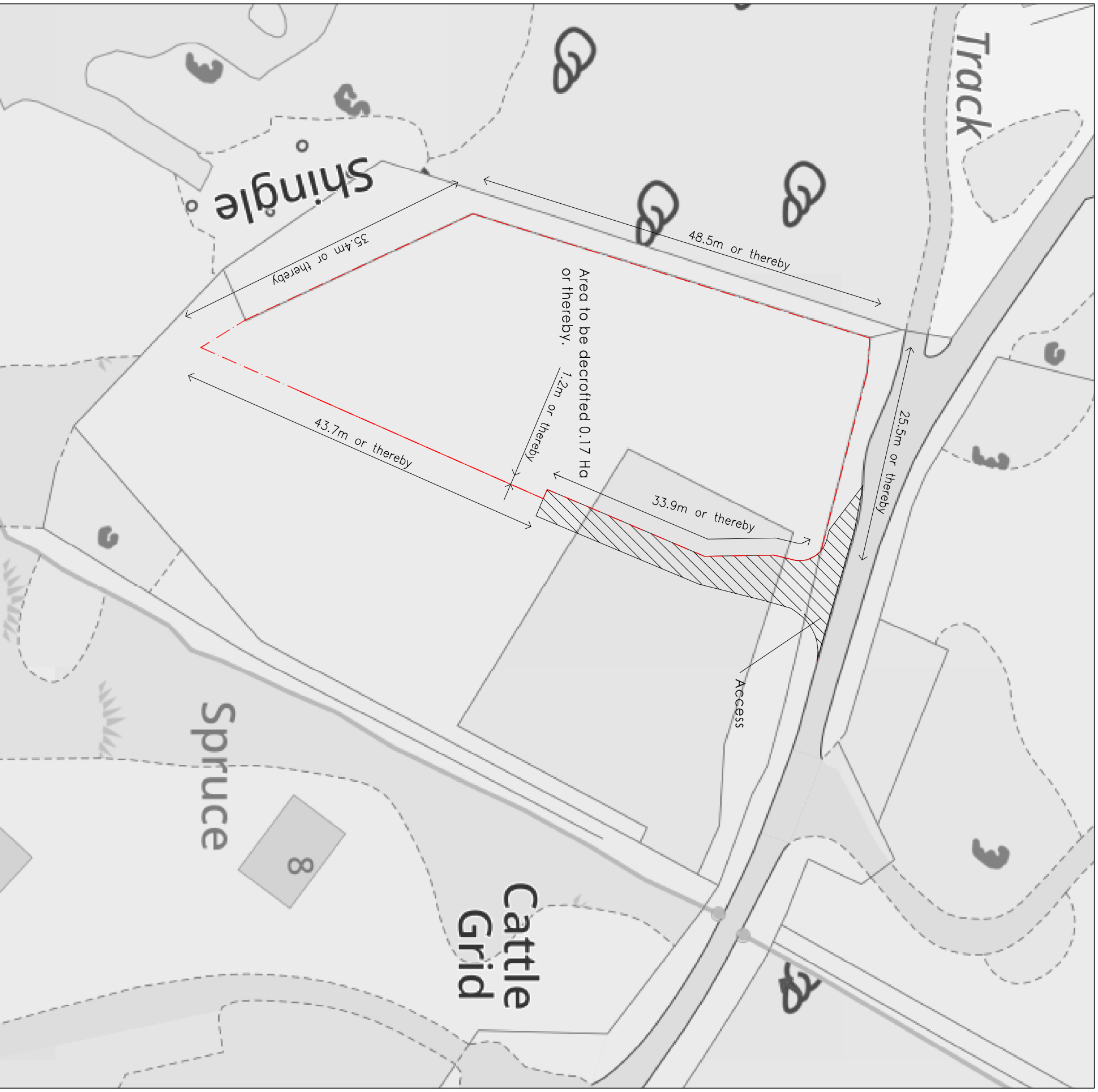
Site Plan Scale 1:500