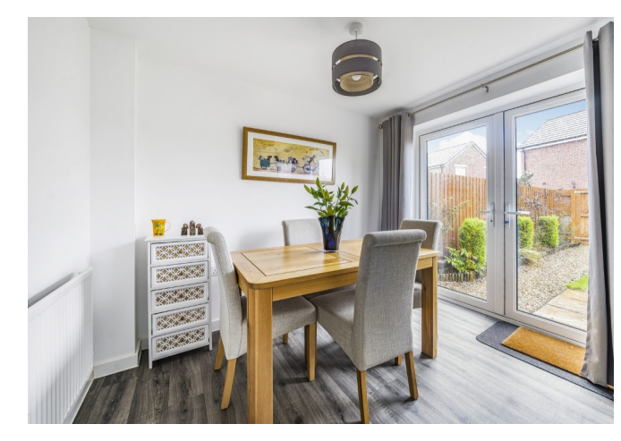
GENERAL REMARKS AND STIPULATIONS:

Tenure: The property is offered for sale freehold by private treaty with vacant possession on completion. Services: Mains water with meter, mains electricity, mains drainage, gas fired central heating. Local Authority: Somerset Council, County Hall, The Crescent, Taunton, Somerset, TA1 4DY Property Location: w3w.co/tolerates.island.placed