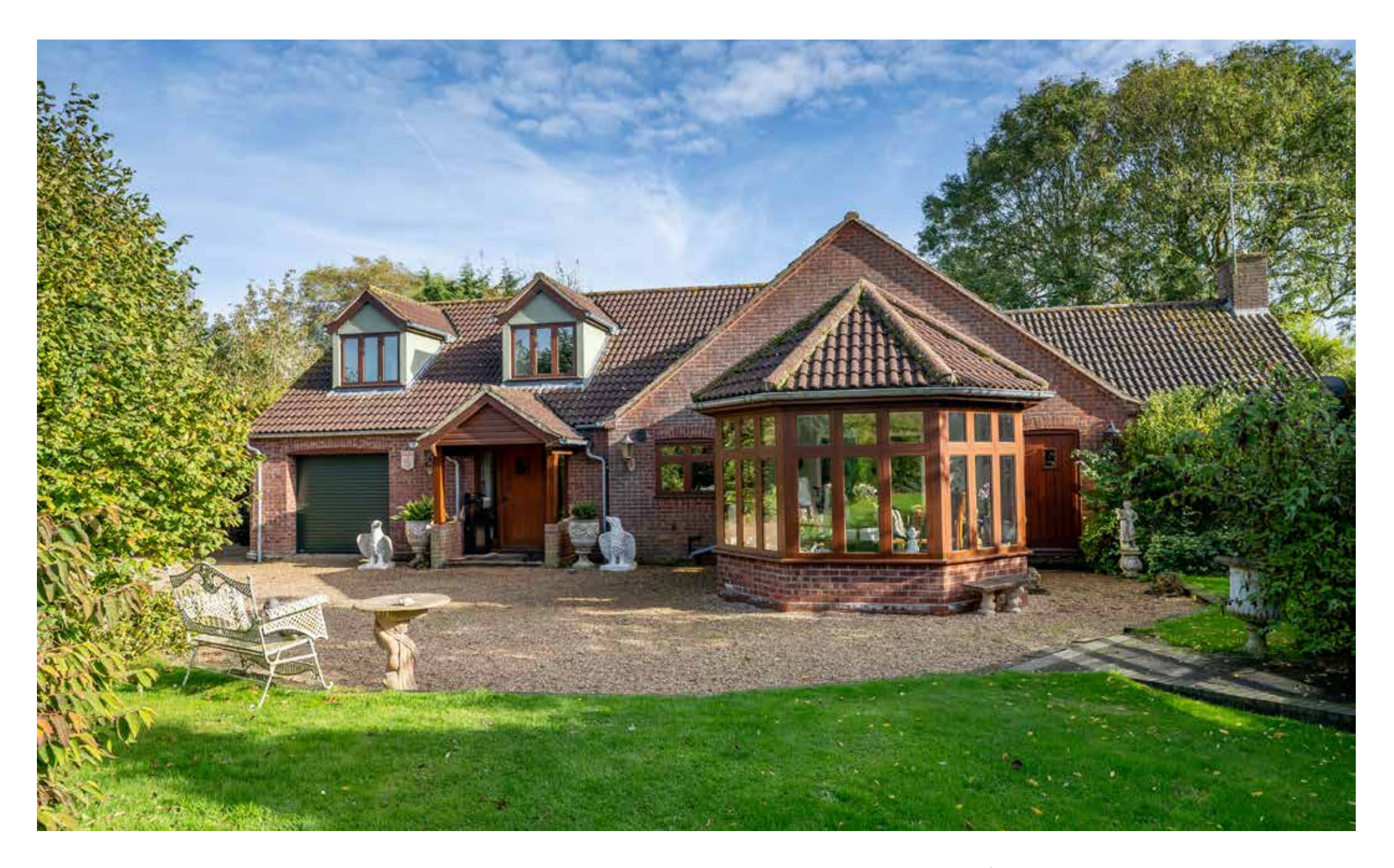
Spike Island Baconsthorpe Road | Hempstead | Norfolk | NR25 6LD