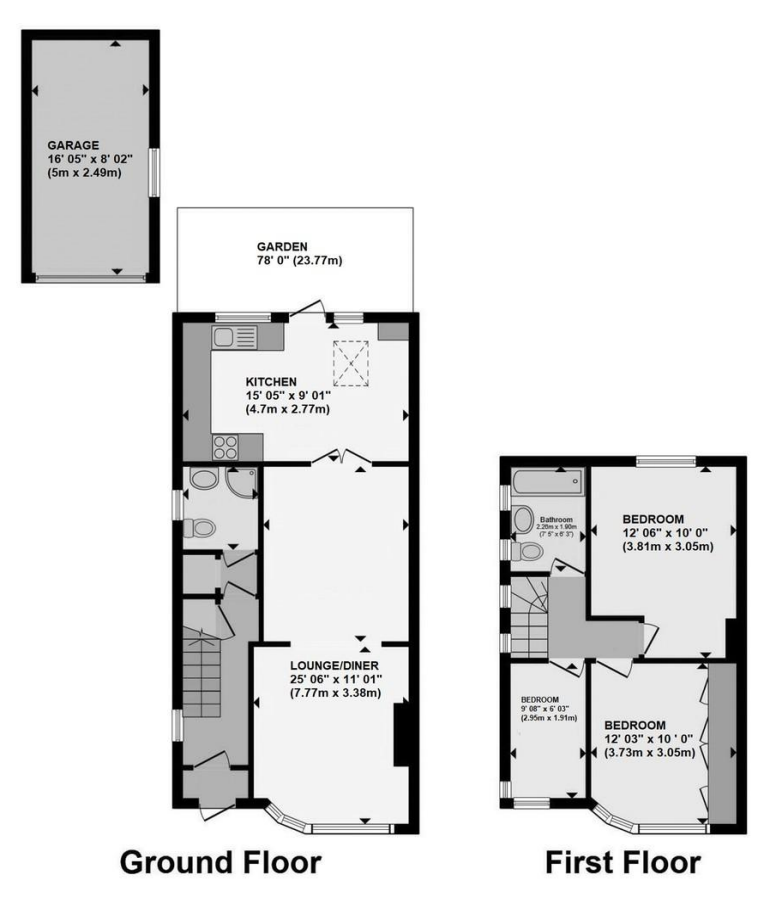
This plan is for illustration purpose only - not to scale