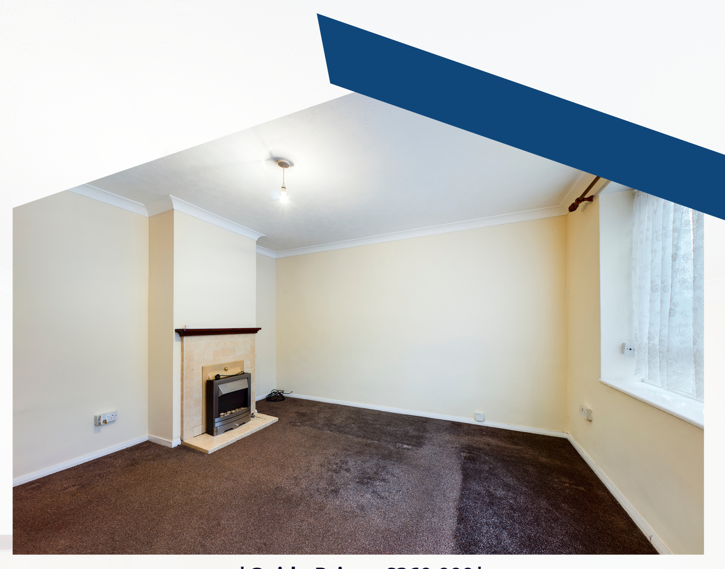
*Guide Price - £360,000*