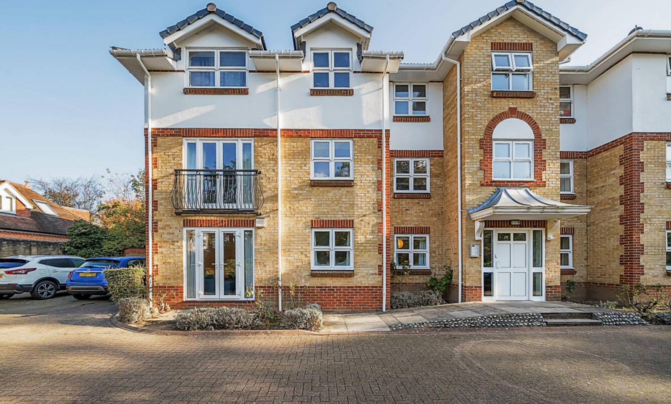
1 Rosebank Close, Teddington £435,000