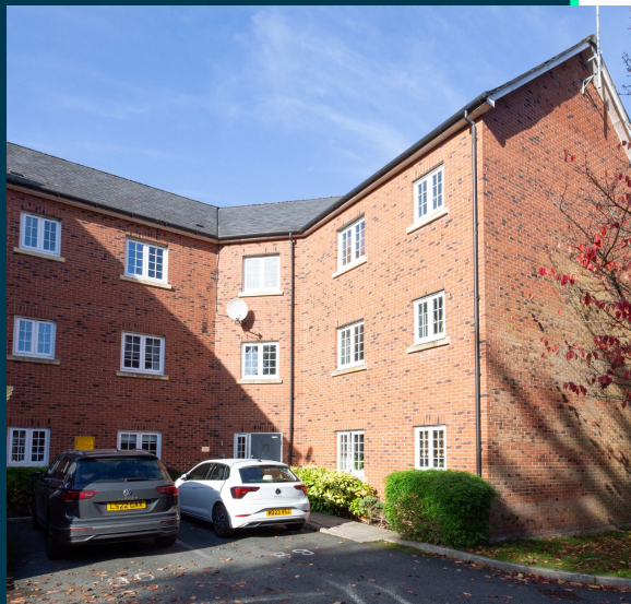
Selside Court, Radcliffe, Manchester, M26 1QT