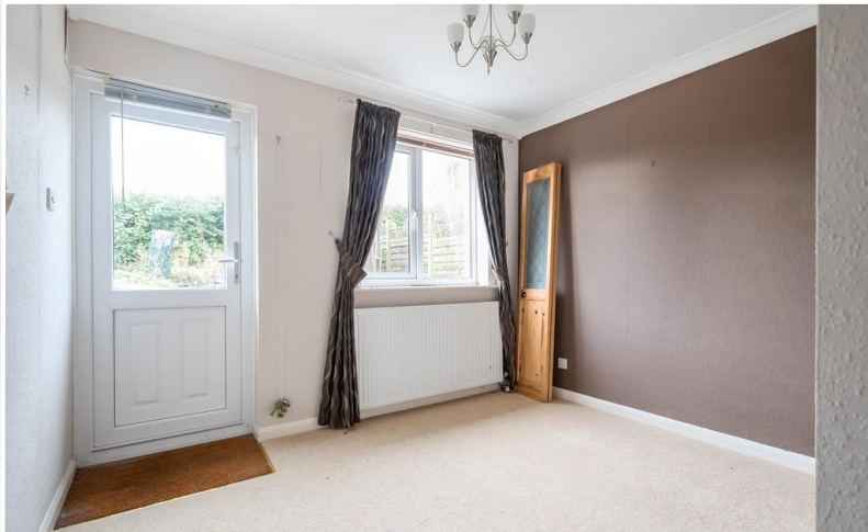
Bedroom 3/Dining Room