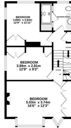
1ST FLOOR 55.1 sq.m. (593 sq.ft.) approx.