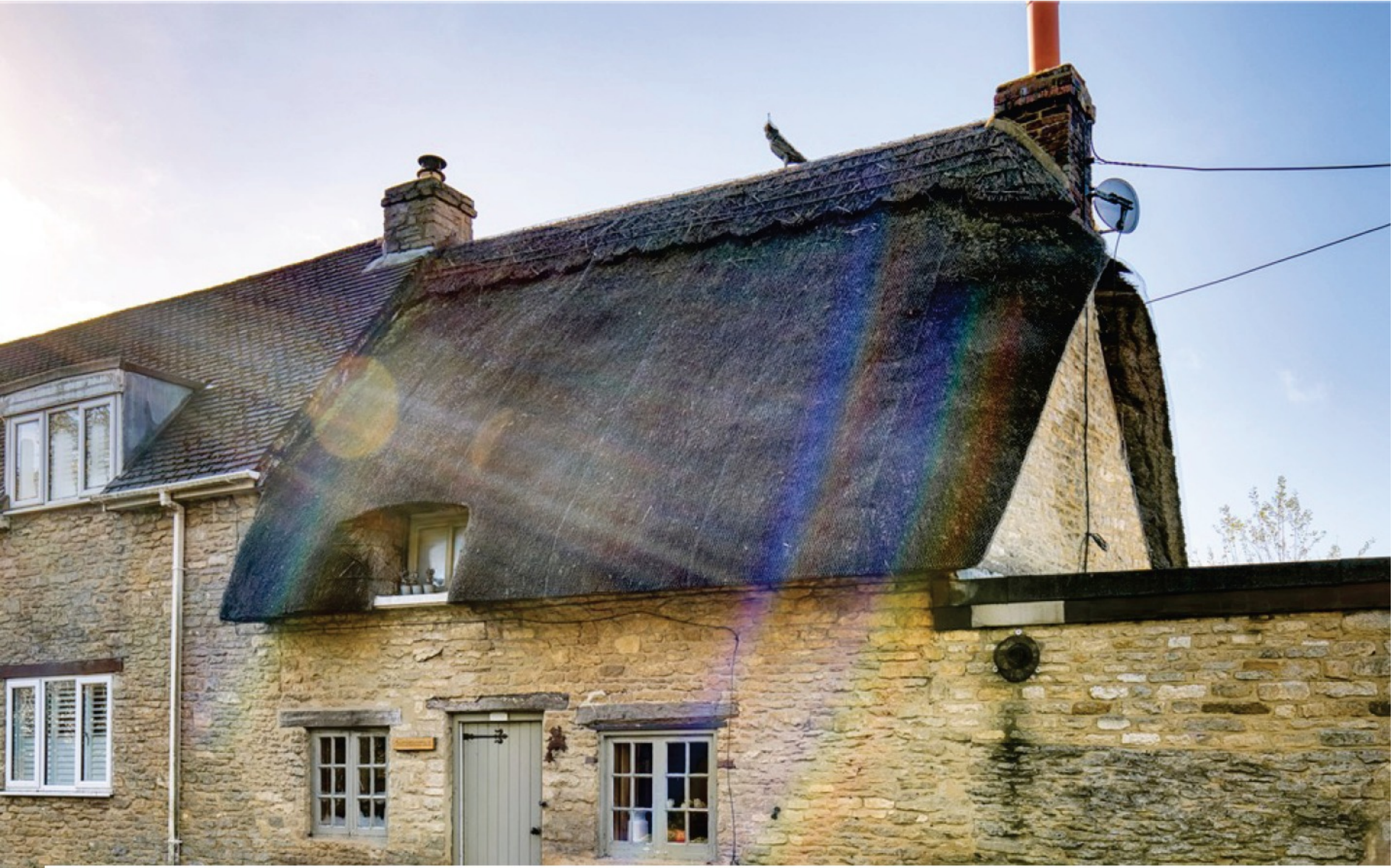
Thatched Cottage, Curbridge